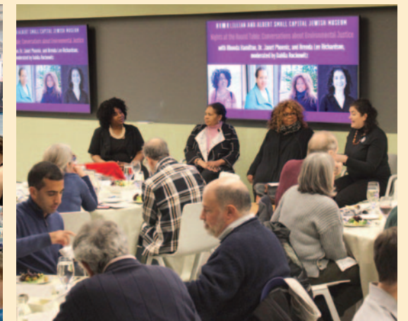
Panel for Nights at the Round Table program on Environmental Justice