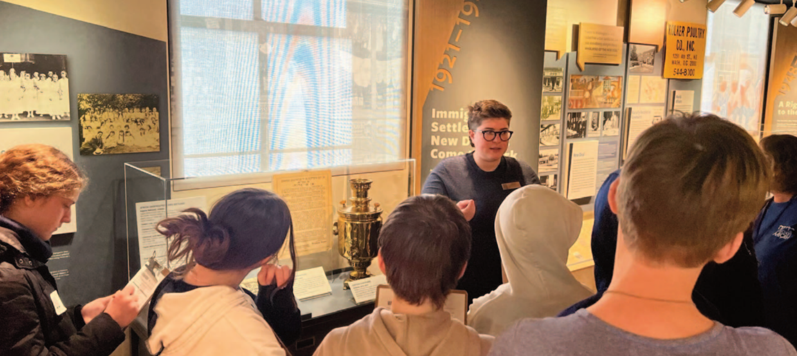
Students on a guided tour of What is Jewish Washington?