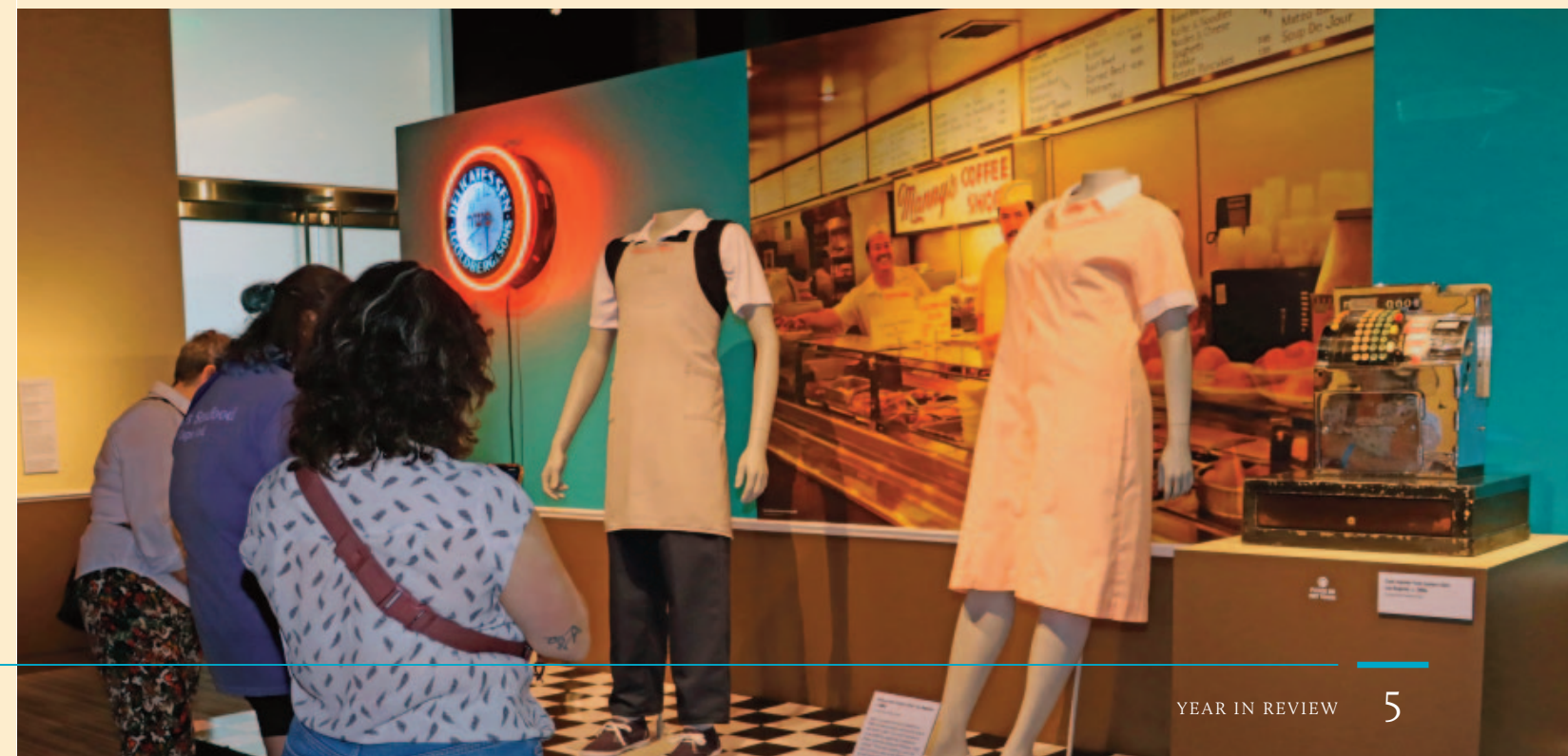
I'll Have What She's Having Exhibition Gallery