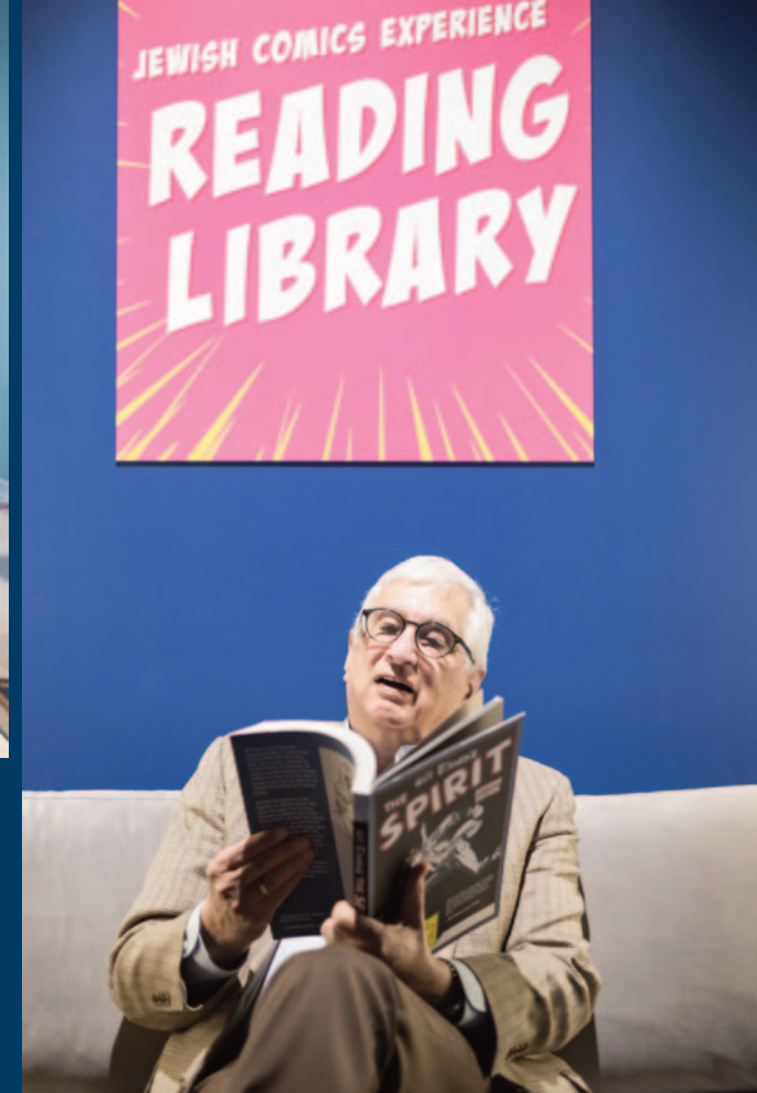
Visitors enjoying the JewCE! exhibition and reading library.

JewCE!: The Jewish Comics Experience , coming from the Center for Jewish History in New York City, explored 100 years of Jewish cartoons, comics, and graphic novels. A visually engaging exhibition, it touched on political cartoons, immigrant stories, female creators, Sunday funnies, some of our favorite superheroes, and much more. Scenes from local DC area comic fandom, a reading room, and an activity space rounded out the exhibition, welcoming new and old comic enthusiasts into the story.