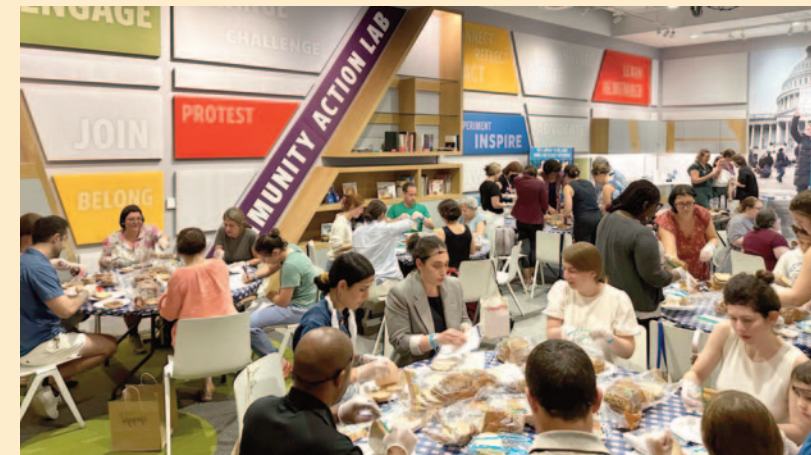
Salon Nights: Homemade Sandwiches for Good program in partnership with MAZON and the Edlavitch DCJCC. Attendees prepare sandwiches to donate to neighbors in need.