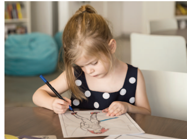
Young visitor interacting with family programming in the Community Action Lab.

The Washington Post captured the vibrancy of the day in a feature on the cover of the Metro section. The article conveyed how the Museum became a gathering place for the local Jewish community and for out-of-town visitors eager to learn about the Washington Jewish experience.