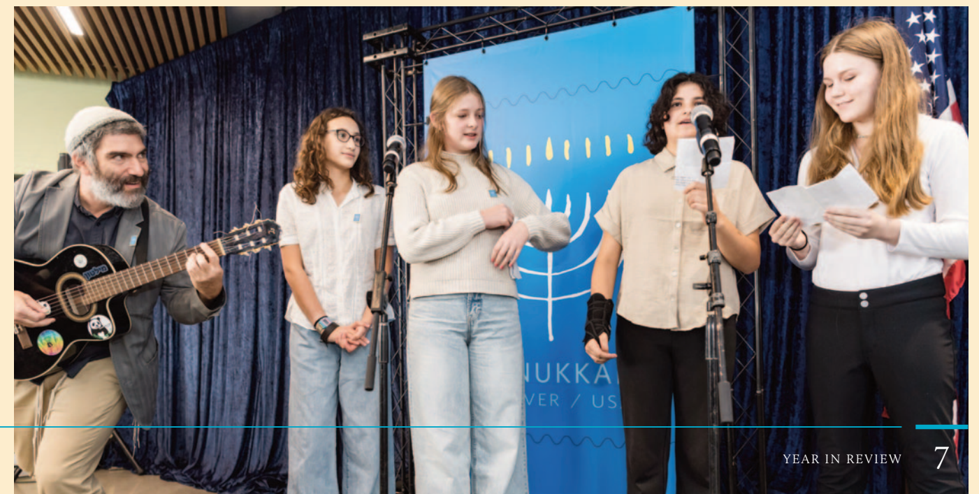
Milton Gotesman Jewish Day School students performing at 2024 Hanukkah stamp unveiling ceremony in partnership with the US Postal Service.