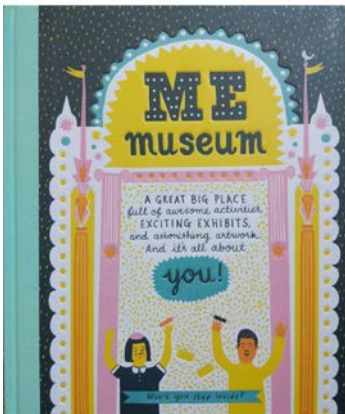
Me Museum © Compendium, 2017

Let's make self-portraits to hang in our museums!